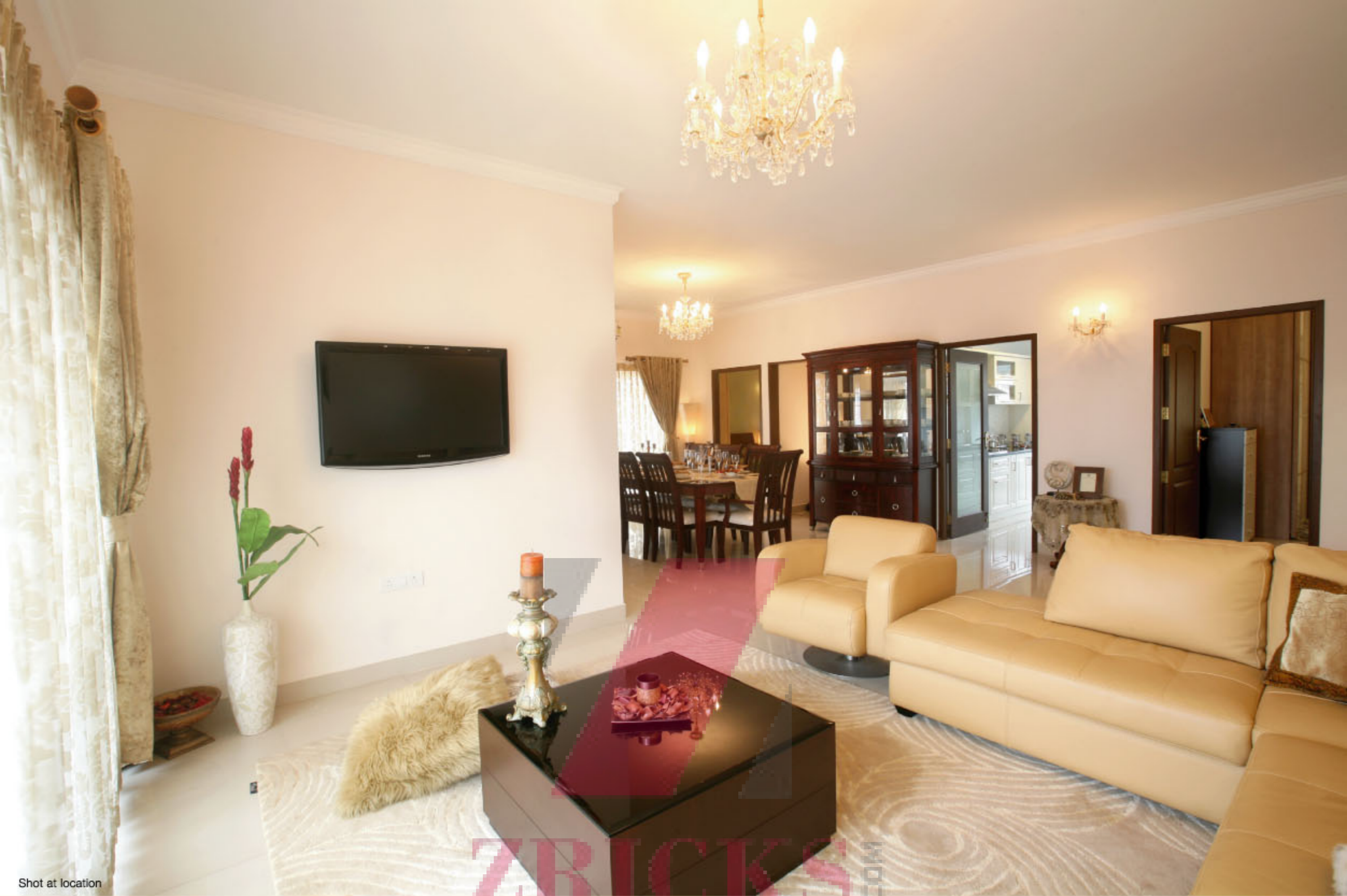
Shot at location