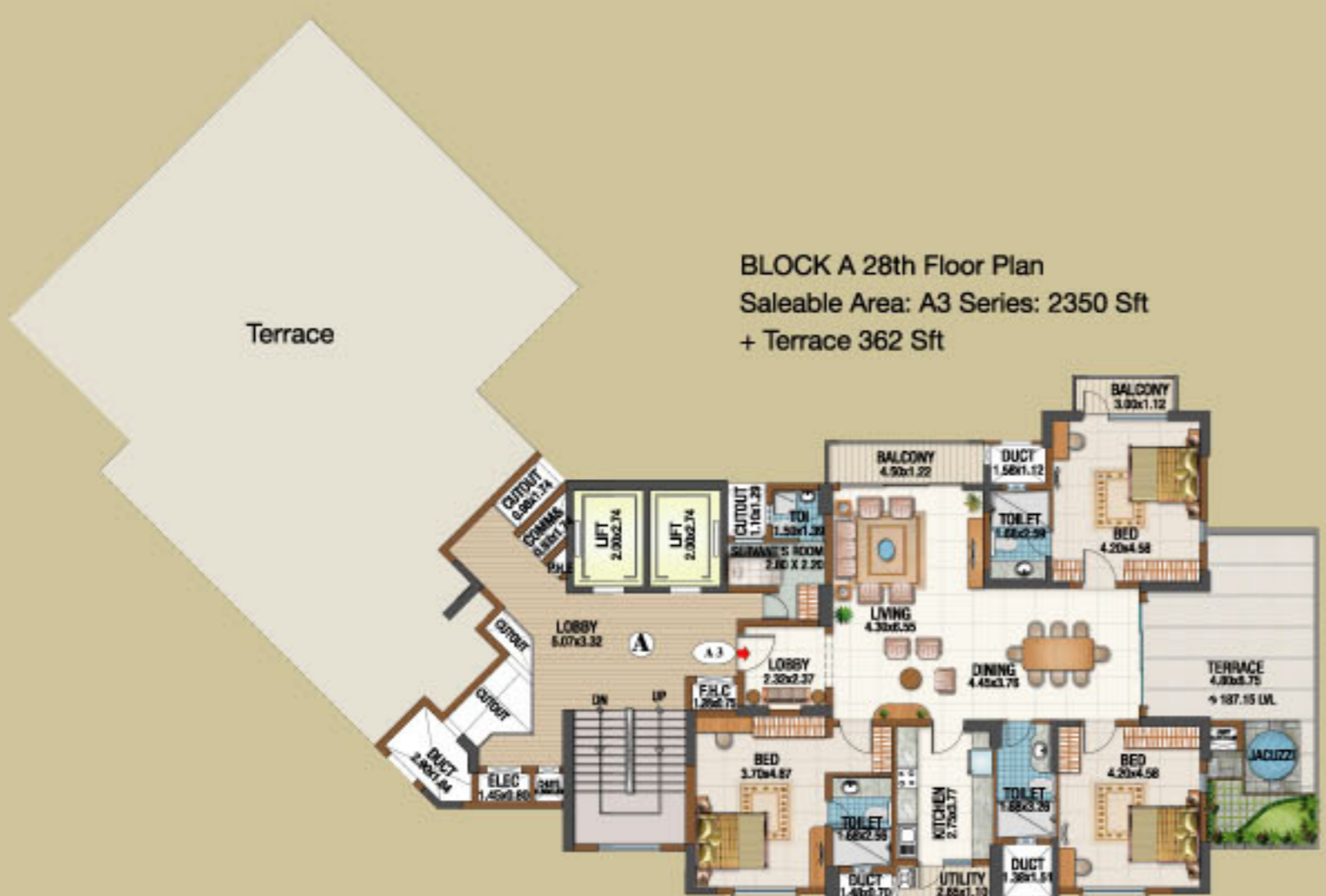
BLOCK A 28th Floor Plan Saleable Area: A3 Series: 2350 Sft + Terrace 362 Sft