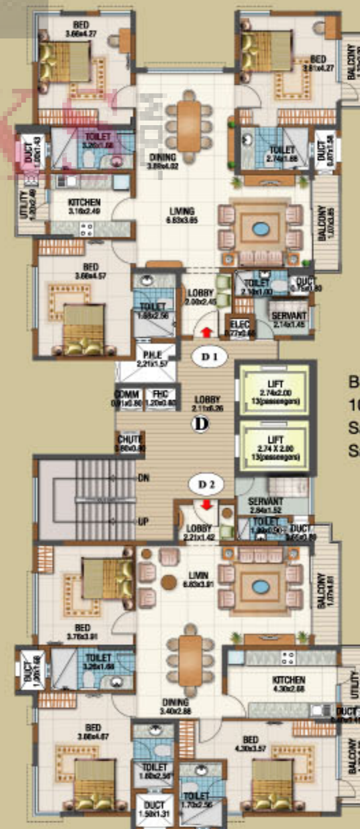
BLOCK C & D Typical Floor Plan 10th, 11th, 12th, 13th, 14th, 15th & 16th Floor Saleable Area: D1 Series: 2033 Sft Saleable Area: D2 Series: 2031 Sft