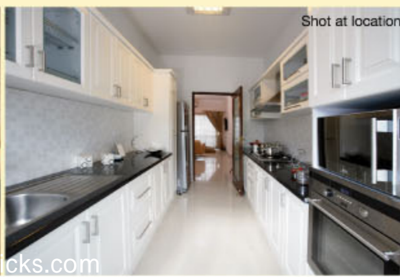
Shot at location