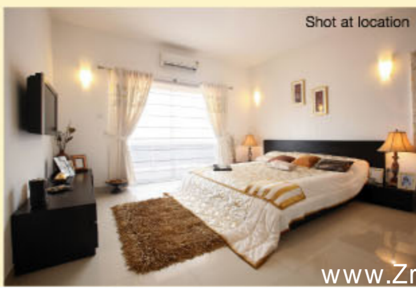
Shot at location