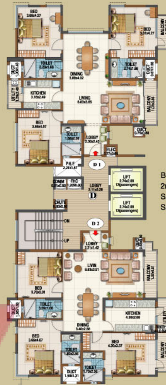
BLOCK C & D Typical Floor Plan 2nd, 3rd 4th, 5th, 6th, 7th, 8th & 9th Floor Saleable Area: D1 Series: 1942 Sft Saleable Area: D2 Series: 1933 Sft