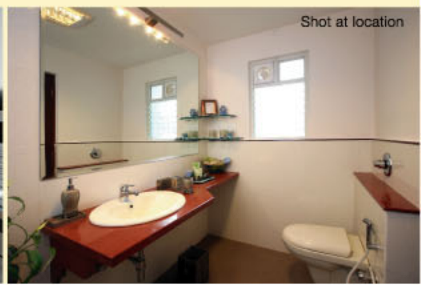
Shot at location