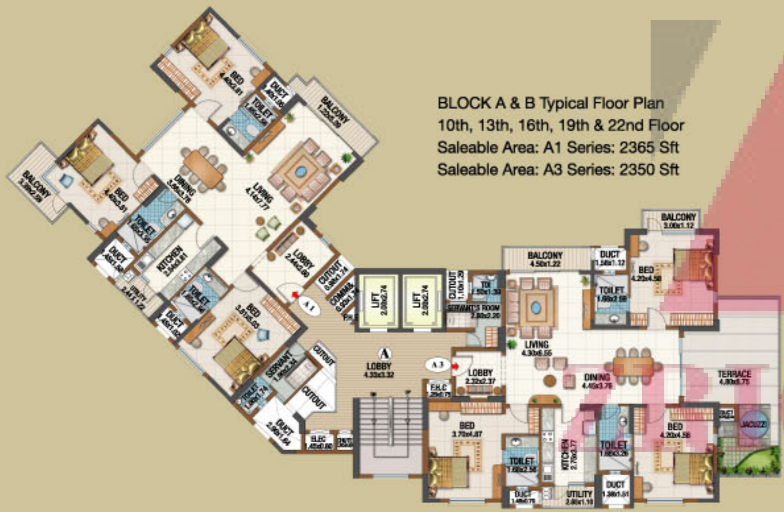
BLOCK A & B Typical Floor Plan 10th, 13th, 16th, 19th & 22nd Floor Saleable Area: A1 Series: 2365 Sft Saleable Area: A3 Series: 2350 Sft