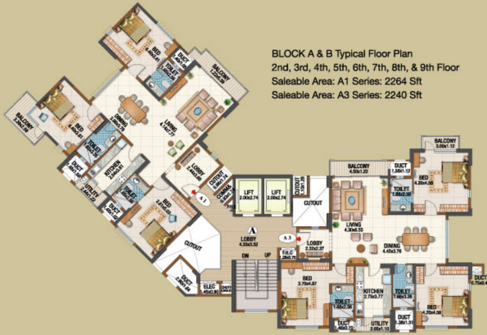
BLOCK A & B Typical Floor Plan 2nd, 3rd, 4th, 5th, 6th, 7th, 8th, & 9th Floor Saleable Area: A1 Series: 2264 Sft Saleable Area: A3 Series: 2240 Sft